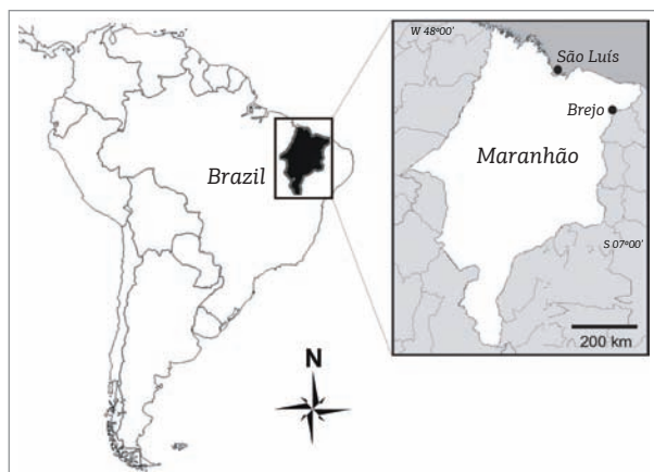
Figure 1. Location of the city of Brejo, Maranhão State.

Etymology. The generic name refers to the Codó Formation, the lithostratigraphic unit where the specimen comes from.